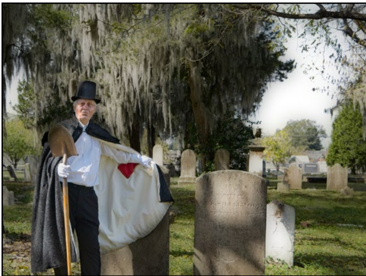
Community Service for New Bern Ghost Walk (10/7/23)