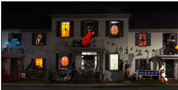
Cedar Grove Cemetery (long exposure) (10/10/23)