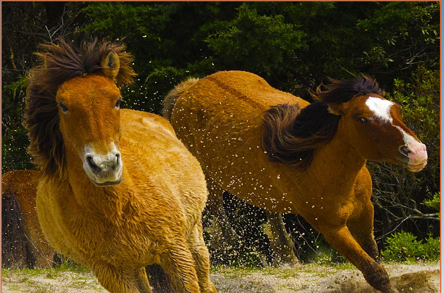
Gallop by Alan Welch