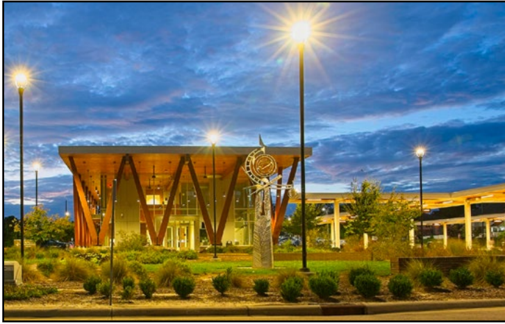
Greenville Art Walk (10/6/23)