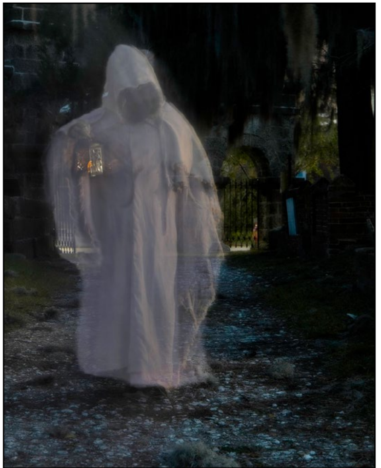
Cedar Grove Cemetery (long exposure) (10/10/23)