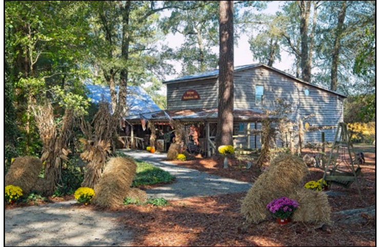
Z.A.K.s in Mallardtwn (10/21/23)